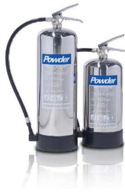
DP EX6SS 6kg ABC Powder DP EX9SS 9kg ABC Powder

These extinguishers have high-gloss stainless steel cylinders and plastic protection bases, and are suitable for specialist and prestige applications.