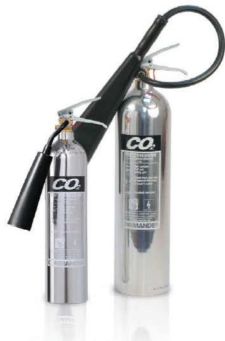
CO EX2P 2kg Carbon Dioxide CO EX5P 5kg Carbon Dioxide

Highly-polished light alloy cylinders make these extinguishers the choice for areas where appearance is a consideration.